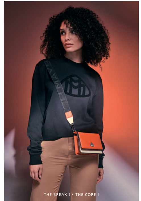
THE BREAK I • THE CORE I