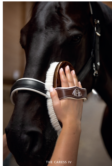
THE CARESS IV