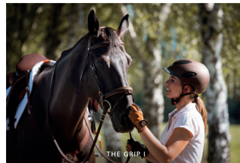
THE GRIP I