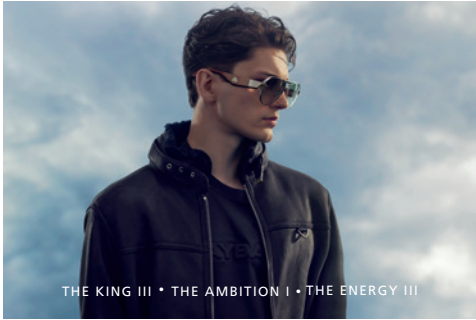
THE KING III • THE AMBITION I • THE ENERGY III