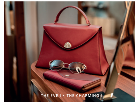
THE EVE I • THE CHARMING I