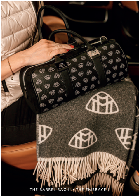
THE BARREL BAG-II • THE EMBRACE II