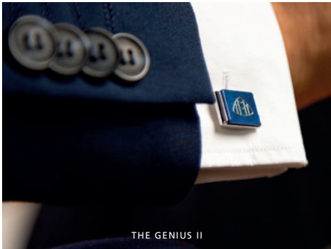
THE GENIUS II