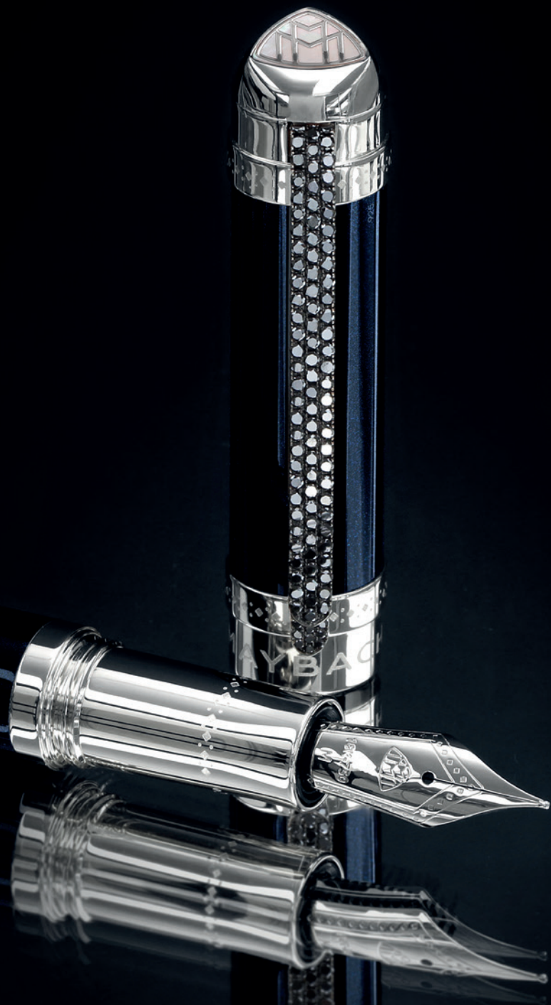
THE PEAK I