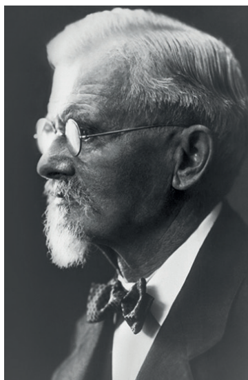
WILHELM MAYBACH, The king among engineering and designers.