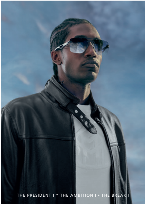
THE PRESIDENT I • THE AMBITION I • THE BREAK I