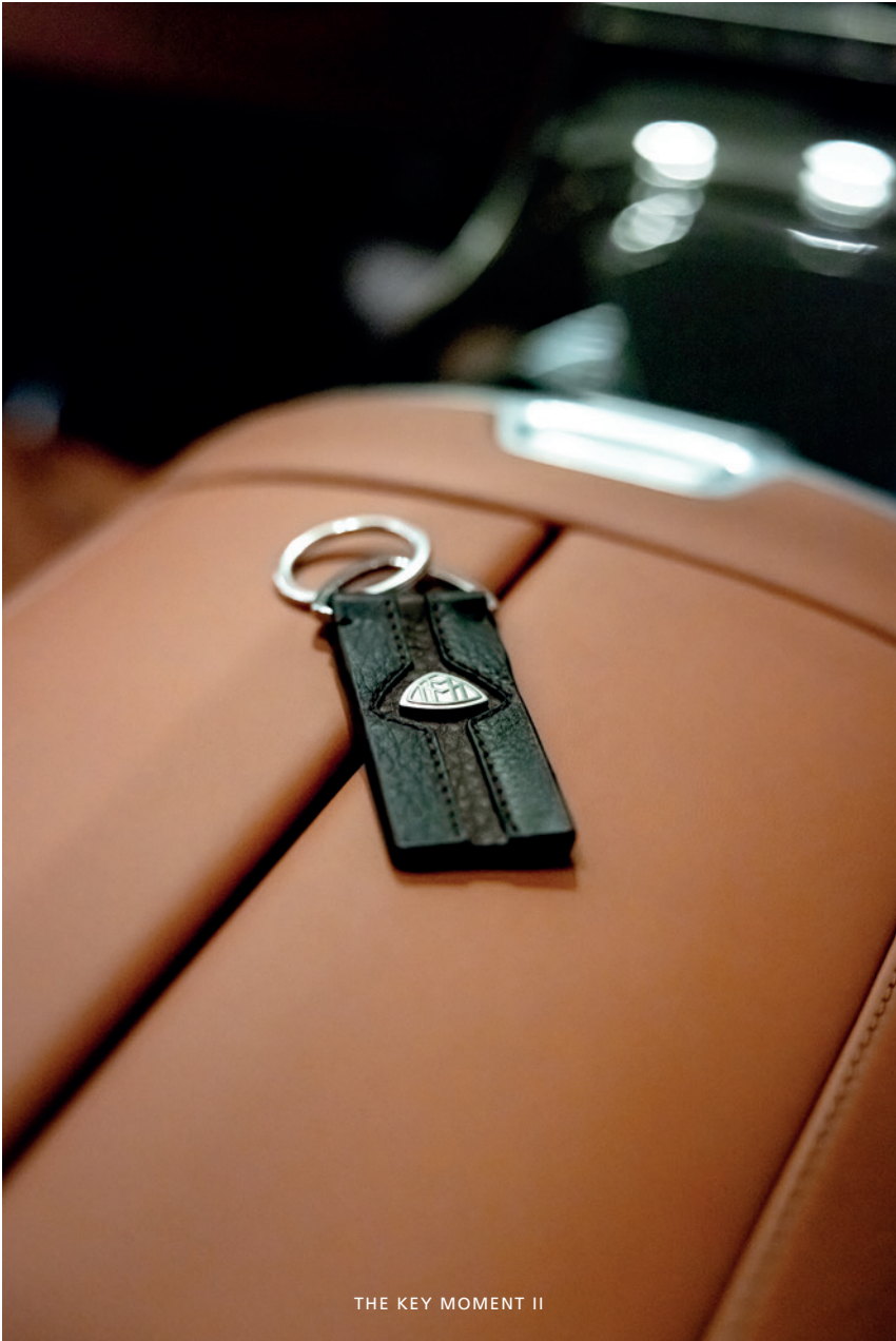
THE KEY MOMENT II