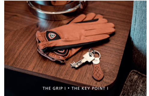
THE GRIP I • THE KEY POINT I