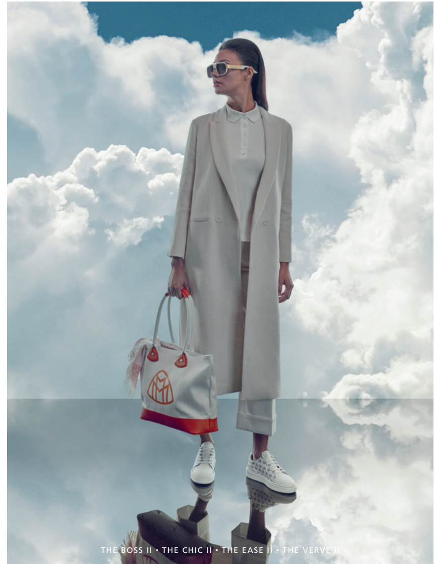
THE BOSS II • THE CHIC II • THE EASE II • THE VERVE II