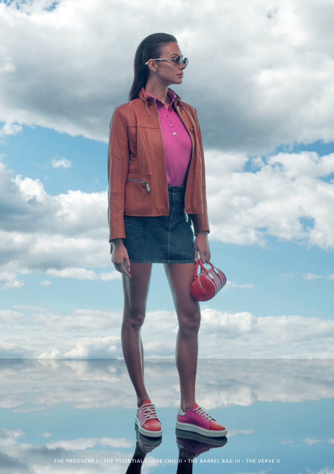
THE PRODUCER I • THE ESSENTIAL I • THE CHIC II • THE BARREL BAG III • THE VERVE II