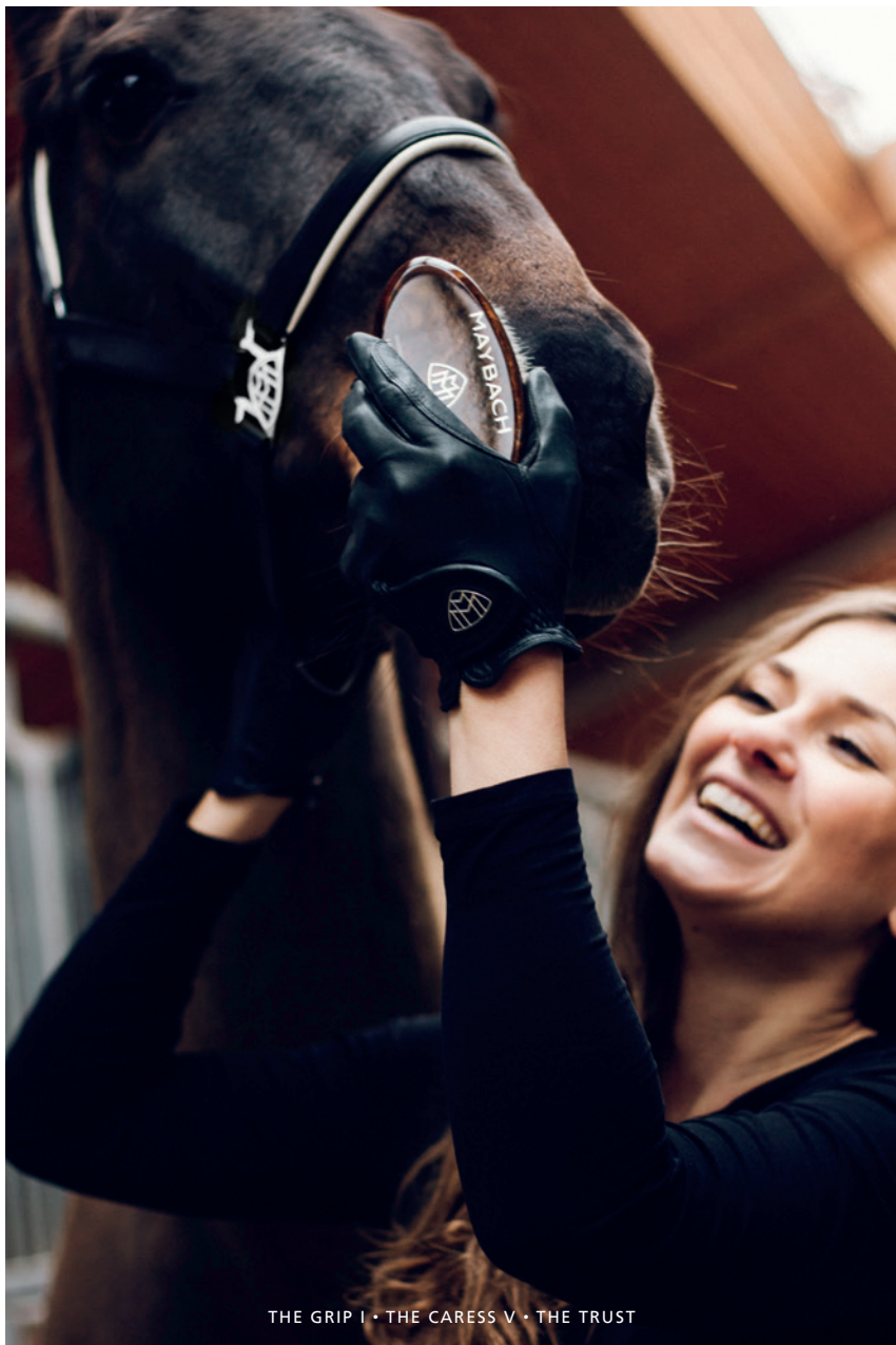
THE GRIP I • THE CARESS V • THE TRUST