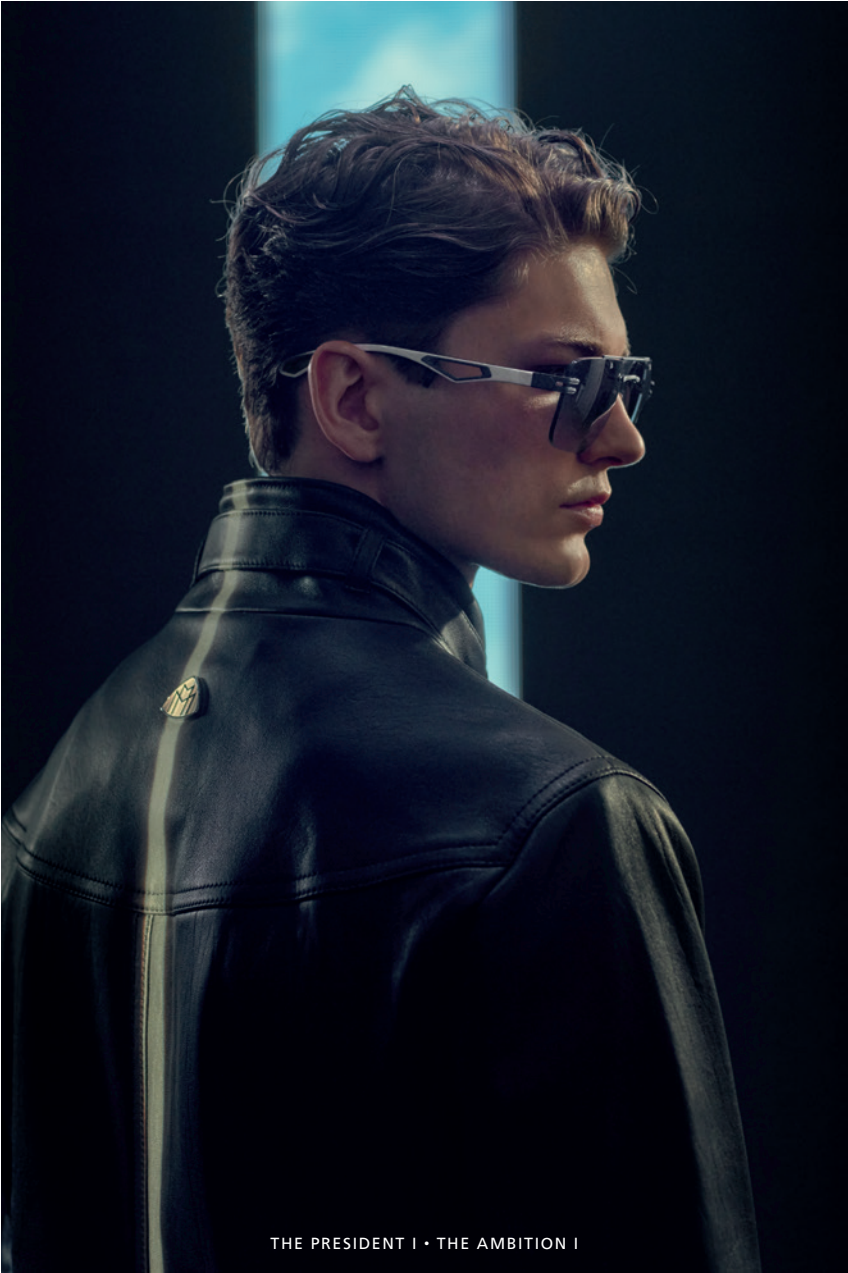
THE PRESIDENT I • THE AMBITION I