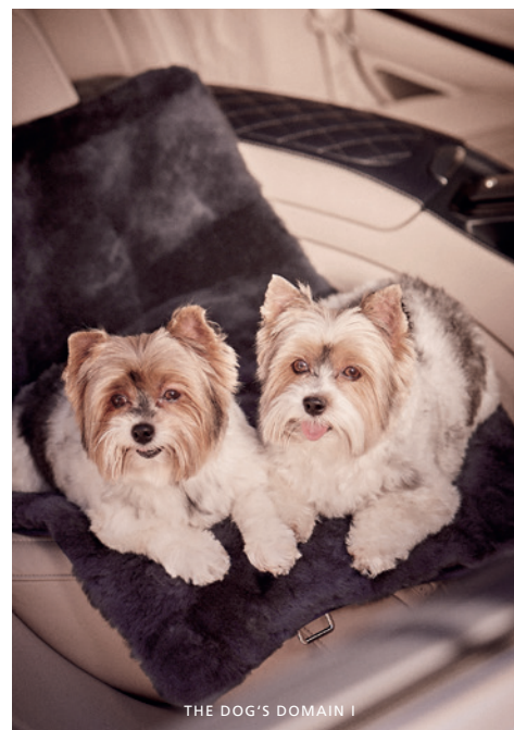
THE DOG'S DOMAIN I