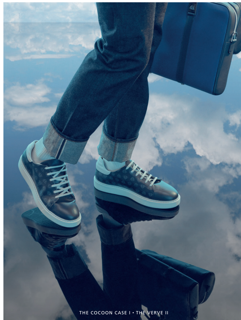
THE COCOON CASE I • THE VERVE II