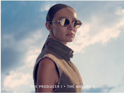
THE PRODUCER I • THE NATURE II