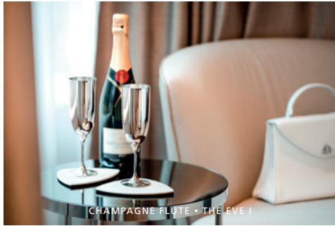
CHAMPAGNE FLUTE • THE EVE I