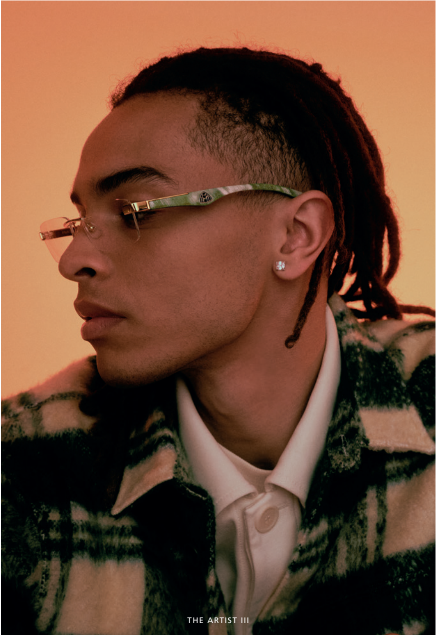
THE ARTIST III