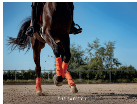
THE SAFETY I