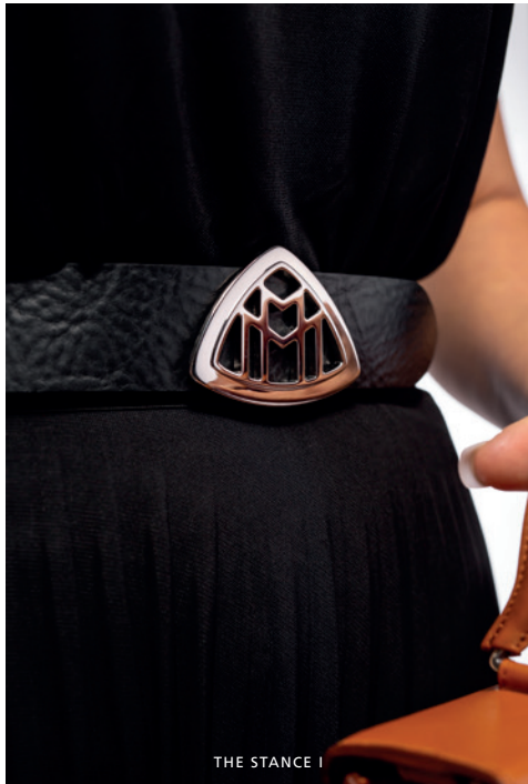
THE STANCE I