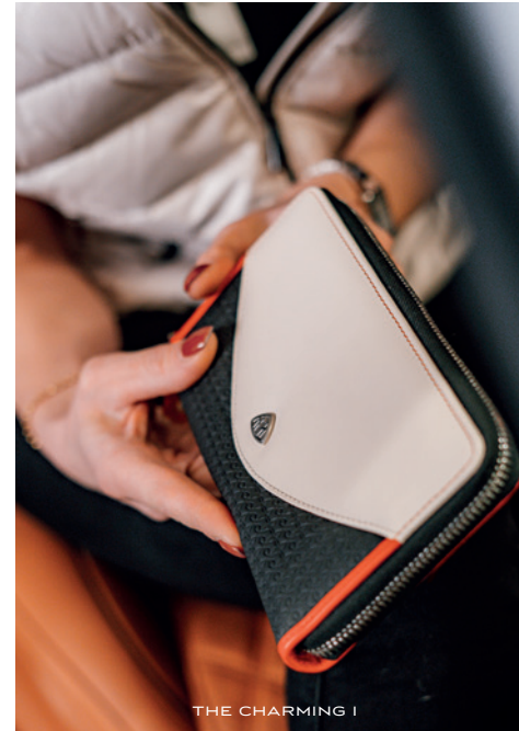
THE CHARMING I