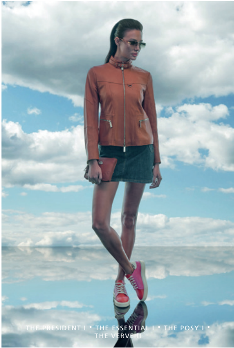
THE PRESIDENT I • THE ESSENTIAL I • THE POSY I • THE VERVET