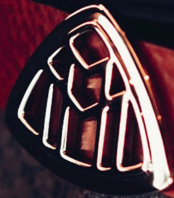
THE STANCE I

As charming as they are practical, our small leather goods are exclusively created from the finest materials and present a profusion of colours, styles and sizes. The premium selections of leather items for men and women reflect the excellence of design and handcrafting for which MAYBACH is famous. The unique blend of finesse and flexibility offers the owner true enjoyment and pure luxury.