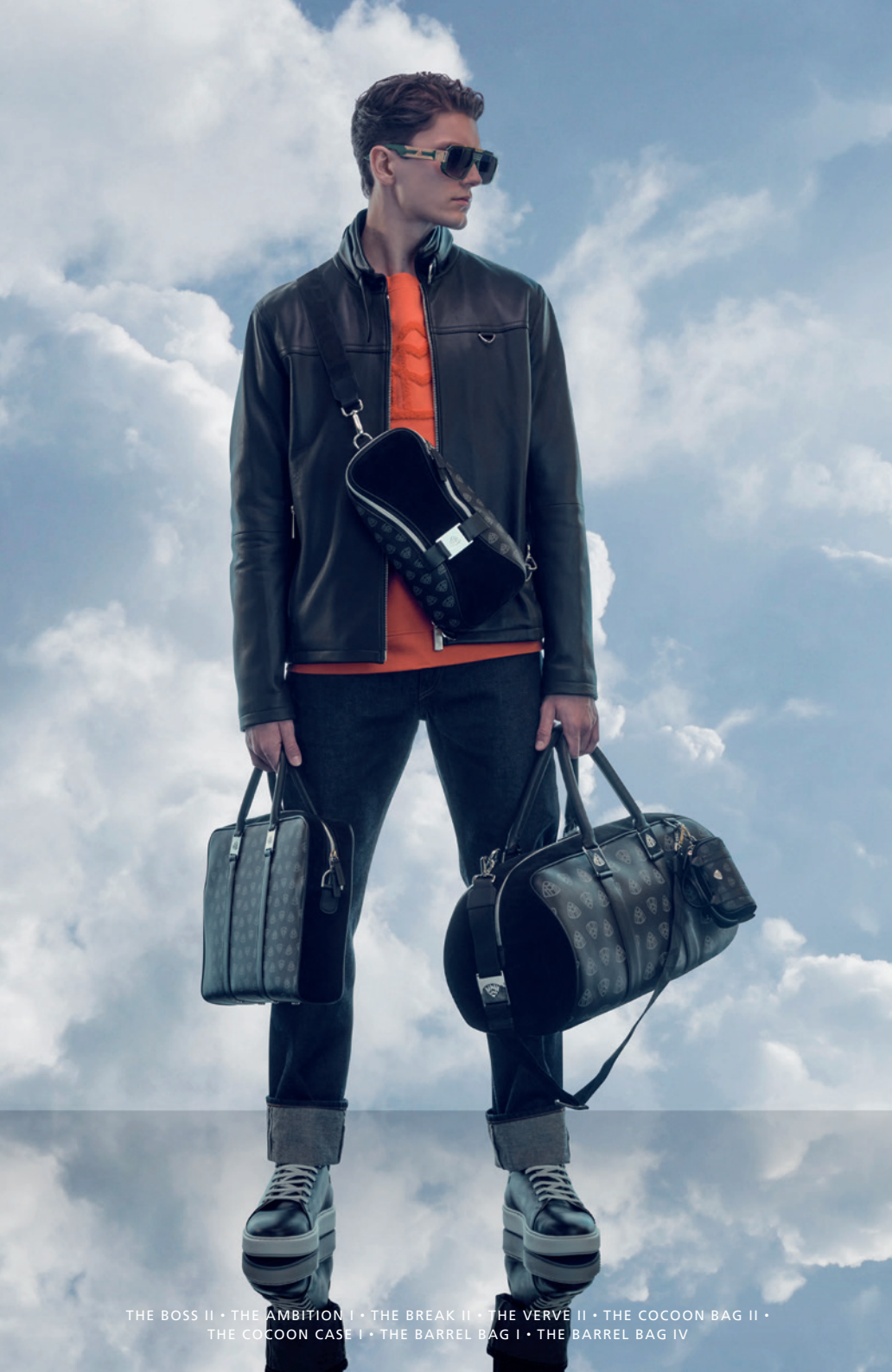
THE BOSS II • THE AMBITION I • THE BREAK II • THE VERVE II • THE COCOON BAG II • THE COCOON CASE I • THE BARREL BAG I • THE BARREL BAG IV